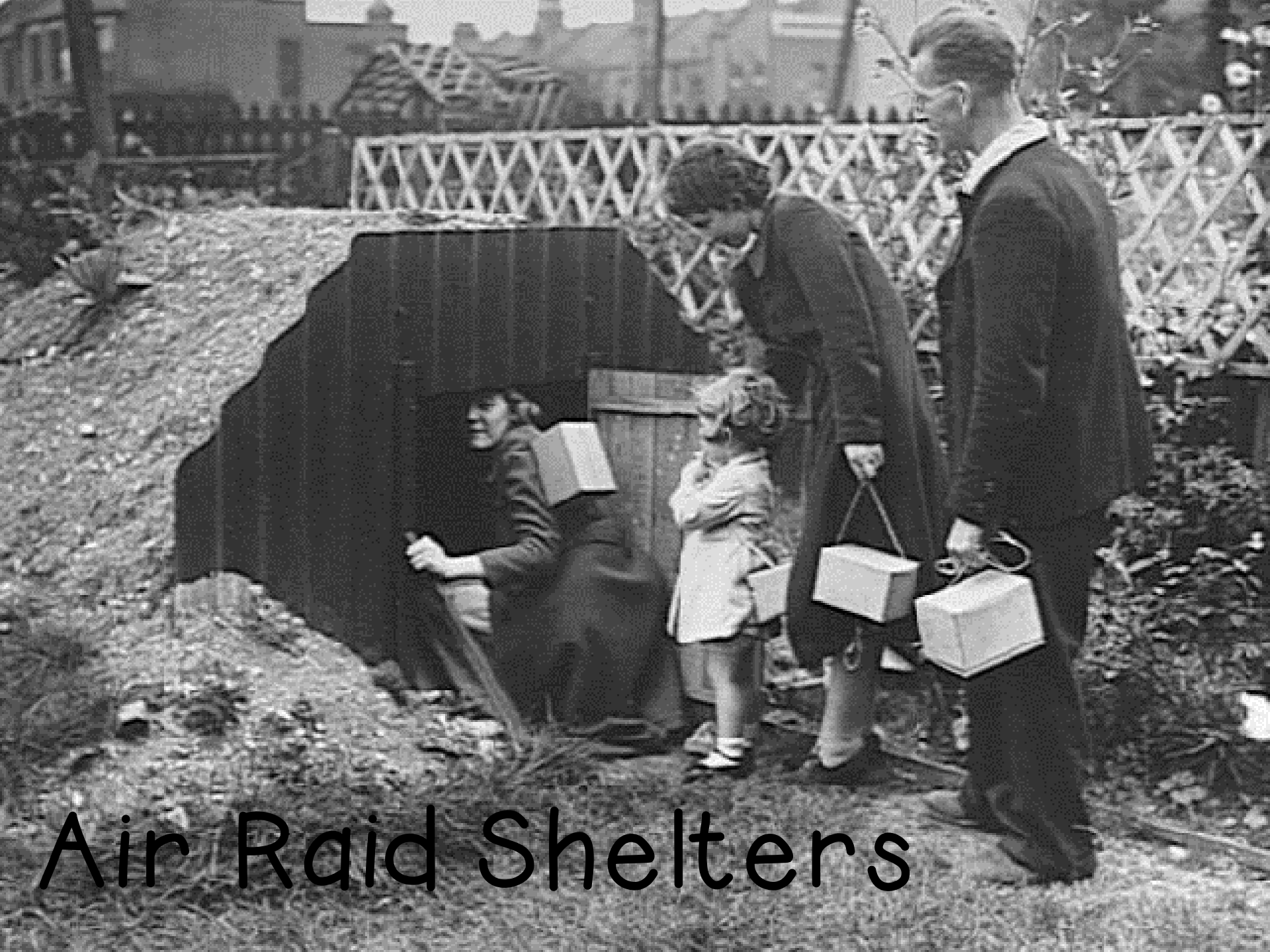
Air Raid Shelters